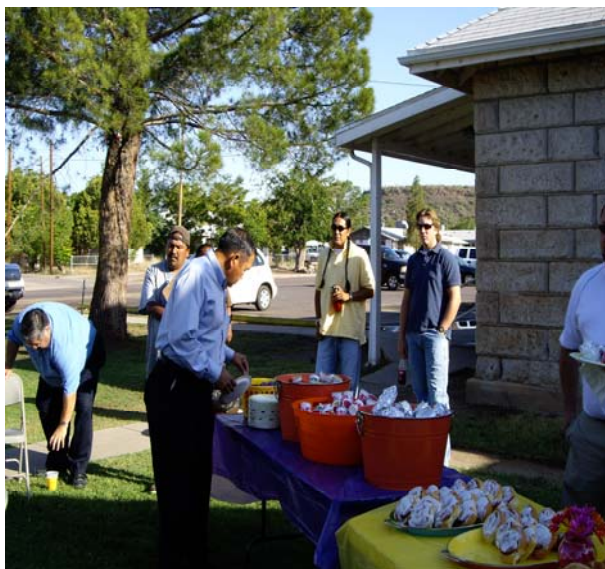
Community members line up to enjoy a continental breakfast before the program begins.